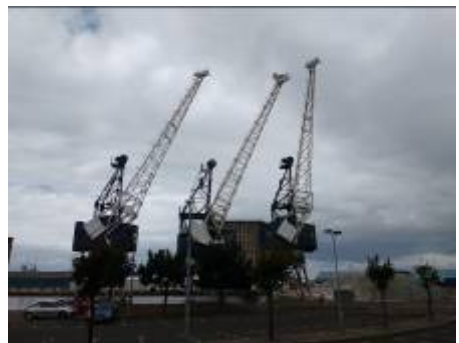
Above from left: 3 of the 12 subjects: Repetition, Secret and Skyline