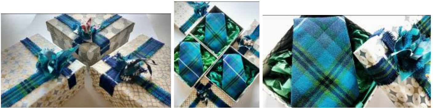
Above from left: Ties commissioned for Fair Trade Fiesta