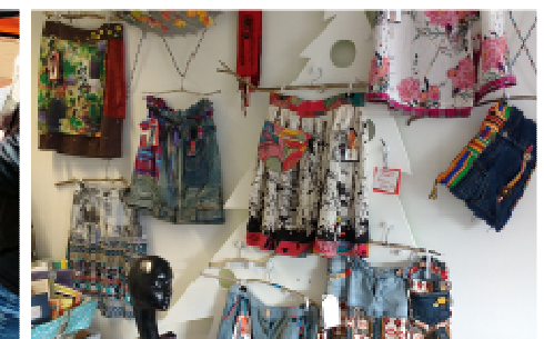
Above from left: Planning the fashion show; Getting ready on the day; Collection of my work modeled