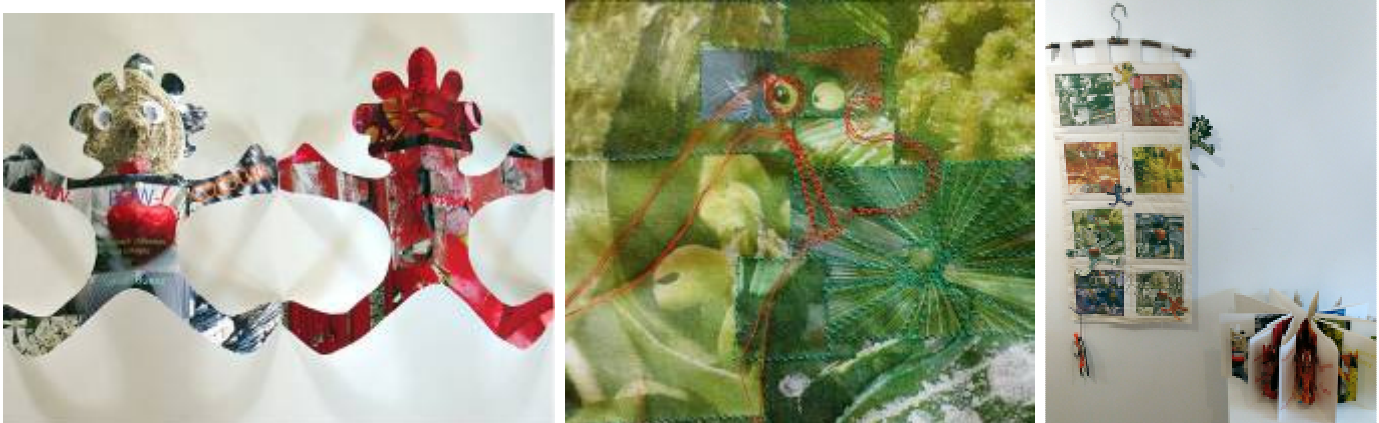
Above from left: Inspiration, preparation and display of 'Rainbow Colours' – altered book and wall hanging

An exhibition of text-related artwork by seven artists from 'Intertwine - Galloway Textile Collective' as part of the 'Big Lit 2017', the Bakehouse Studio's yearly literature festival for Dumfries & Galloway.